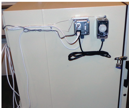
Mounted on the left-hand side of the kiln are the controls, power switch, and outlet, as well as the greenhouse controller. Note the padlock for safety.

A small chest freezer that had quit working began the project. The metal walls with insulation between them help retain heat, making this kiln economical to run, even in wintertime. For safety, I installed a hasp and padlock on the door.