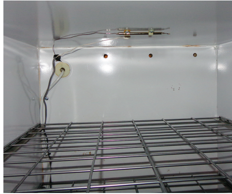
The sensor for the greenhouse controller is mounted to the ceiling inside the kiln. The four holes drilled through the upper back wall of the freezer can be seen.

percent, so the air exiting the kiln often condenses on the outside of the holes. As the drying process progresses, the humidity continues to drop. The time it takes for the blanks to finish drying depends upon: the time of year the tree was cut, wood species, diameter, rough-turned wall thickness, stor-