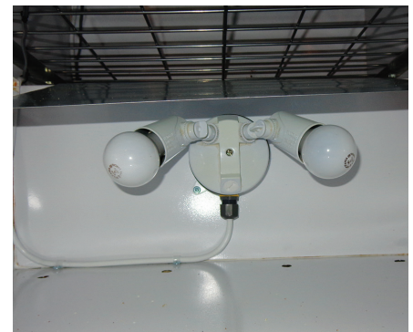
The lightbulbs are mounted on the back of the kiln near the bottom, a sheet of metal covers the bulbs, and the holes are drilled through the bottom of the freezer.

After my first batch of wood was dry, I decided to install a 5" (13cm) fan, salvaged from computer equipment. This fan runs all the time and helps circulate the air, which speeds up the drying process. Without the fan, the first batch of wood took approximately seven weeks to dry. The second batch took only five weeks.