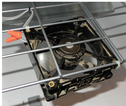
A fan is mounted underneath the wire shelf.

A greenhouse thermostat with a remote sensor monitors and