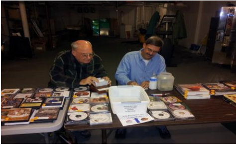
New titles are add regularly to the club Library