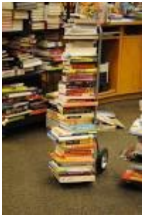
Our crack librarians hauling in the top Woodturning resources for you!